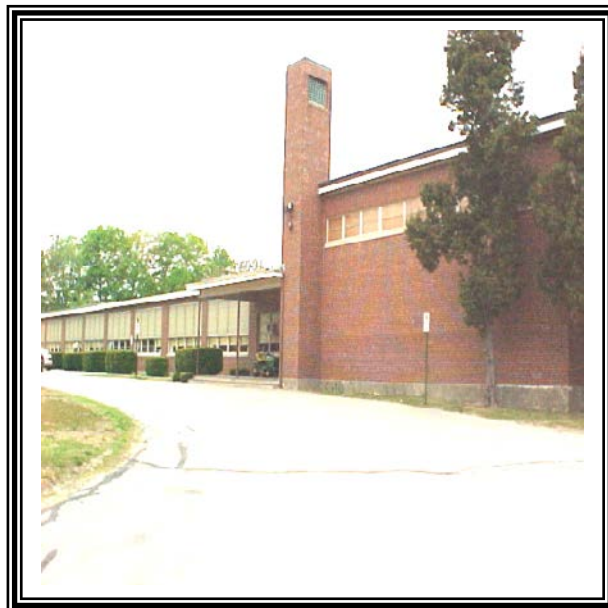
South Elementary School