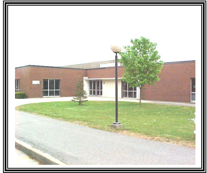
North Elementary School