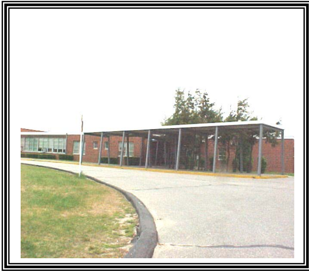
Chace Street School